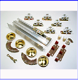
Bypass Door Hardware (Set) 134F

Item: 0004: Bypass Door Hardware (Set) 134F Location: Quantity: 2